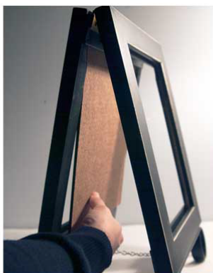
Step 2: Pivot board in past bottom channel