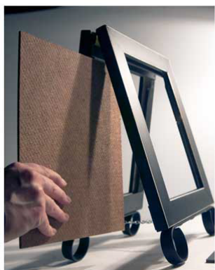
Step 1: Insert top and push up